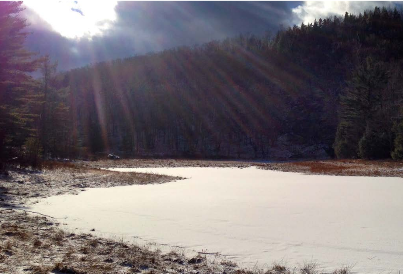
MOOSE POND AT WOLFRUN NATURAL AREA