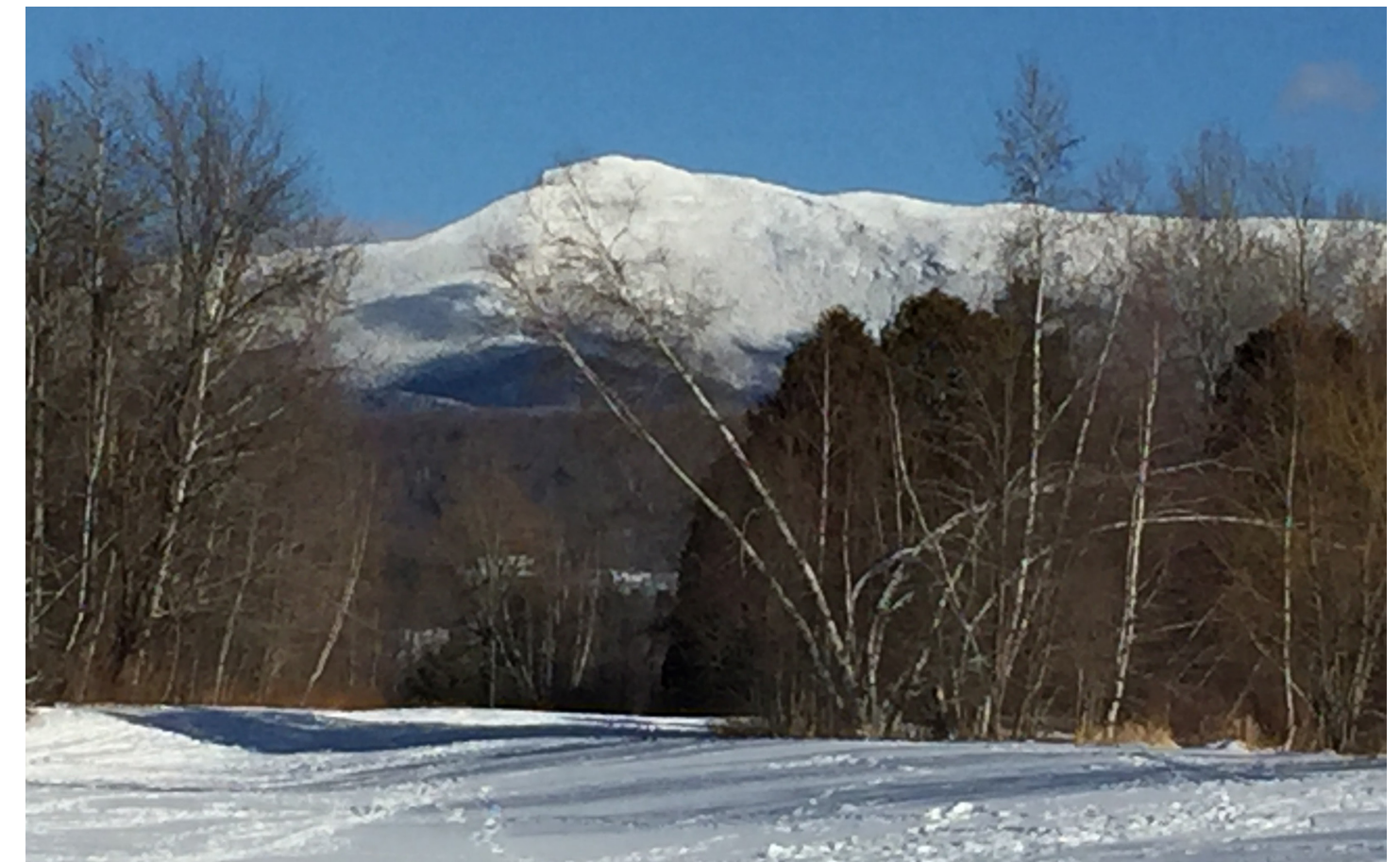
Mills Riverside Park

We have entered the frozen and magical season of winter. Each morning brings a new landscape to be rediscovered. Silent snow has blanketed the ground once more, muffling neighborhood sounds. Naked trees pierce the bright blue sky while the evergreens are draped in white. This quiet season is livened by the joy of children skating, sliding, and playing. Colorfully dressed, they sparkle against a white backdrop. How fortunate we are to experience this enchanted time in a place that we all call home.