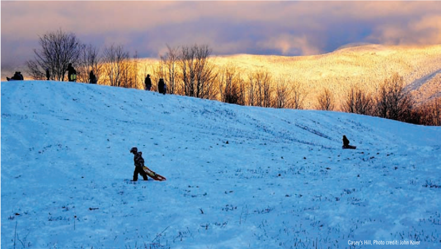
Casey's Hill