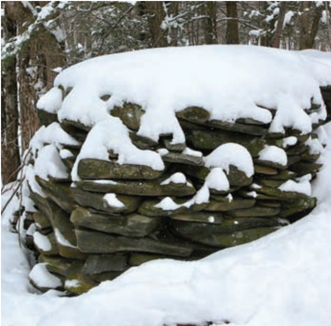
Cairn in Winter