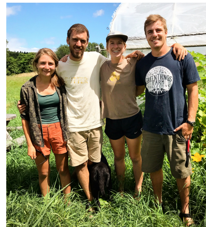
The Farm Upstream