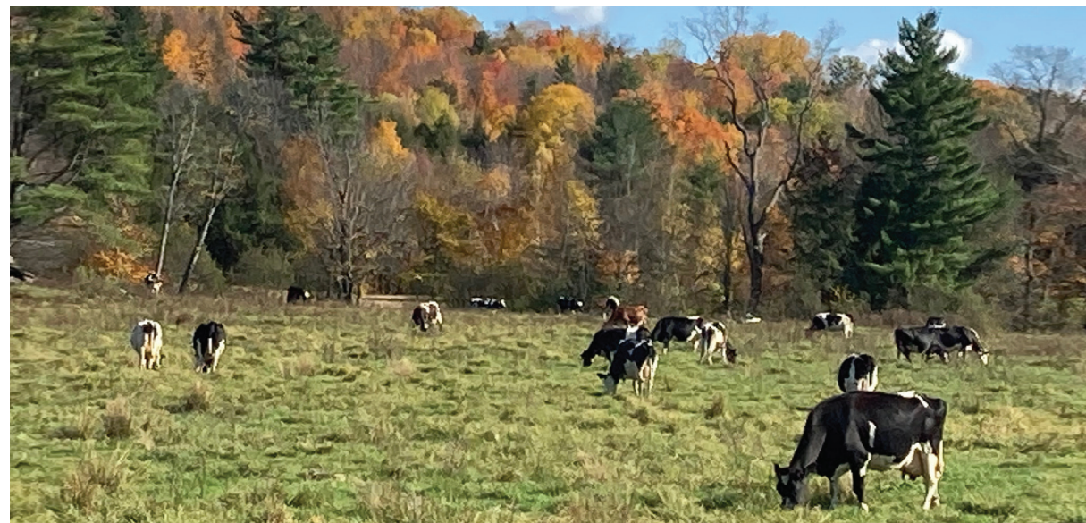
Organic grass-fed cows at the Davis farm