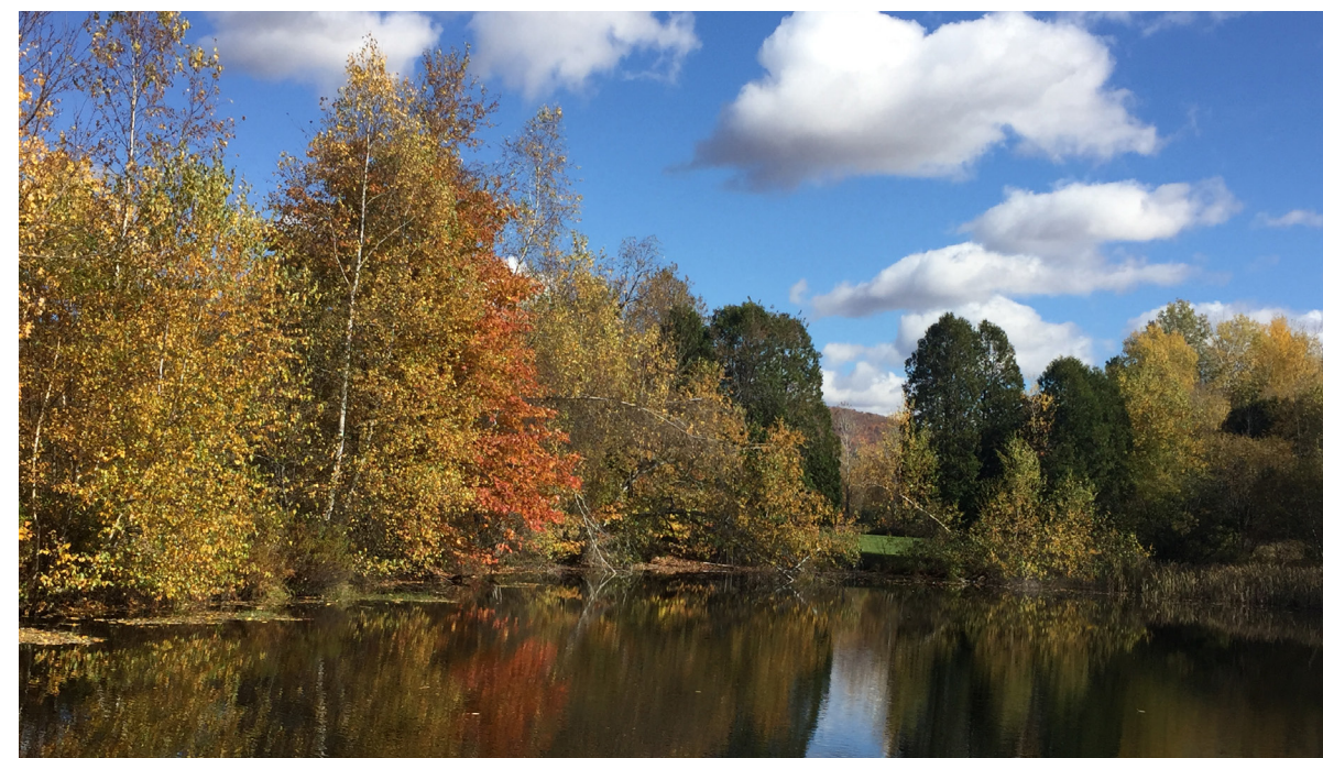
Autumn at Mills Riverside Park